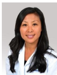
Current Institution: Advocate Children's Hospital, IL