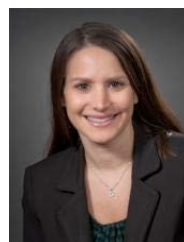
Current Institution: Cohen Children's Medical Center, NY