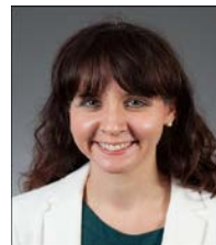
Current Institution: Children's Hospital at Montefiore, NY