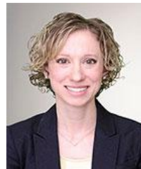
Current Institution: Albany Medical Center, NY