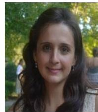
Current Institution: Texas Children's Hospital, TX