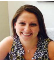
Current Institution: Children's Hospital at Montefiore, NY