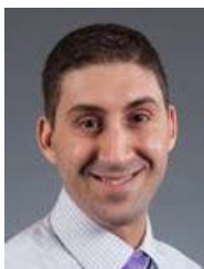
Current Institution: MD Anderson Houston, TX