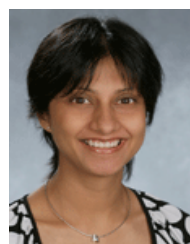
Current Institution: Phoenix Children's Hospital, AZ

Priti Tewari: pxtewari@texaschildrens.org