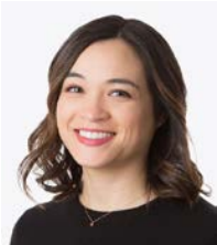
Current Institution: Children's Hospital at Montefiore, NY